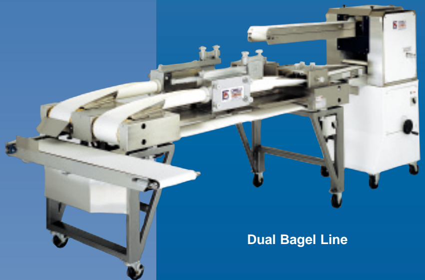
Dual Bagel Line

G. Cinelli-Esperia Corporation, the standard by which all will be judged