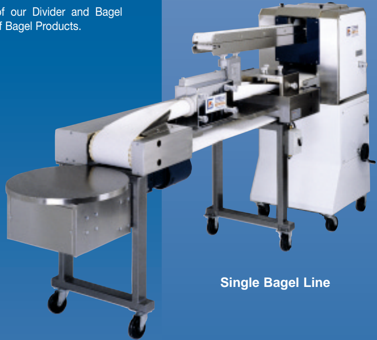
Single Bagel Line