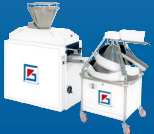
CG/VBD BREAD DIVIDER & SABOTIN AB CONICAL ROUNDER

G. Cinelli-Esperia Corporation, the standard by which all will be judged