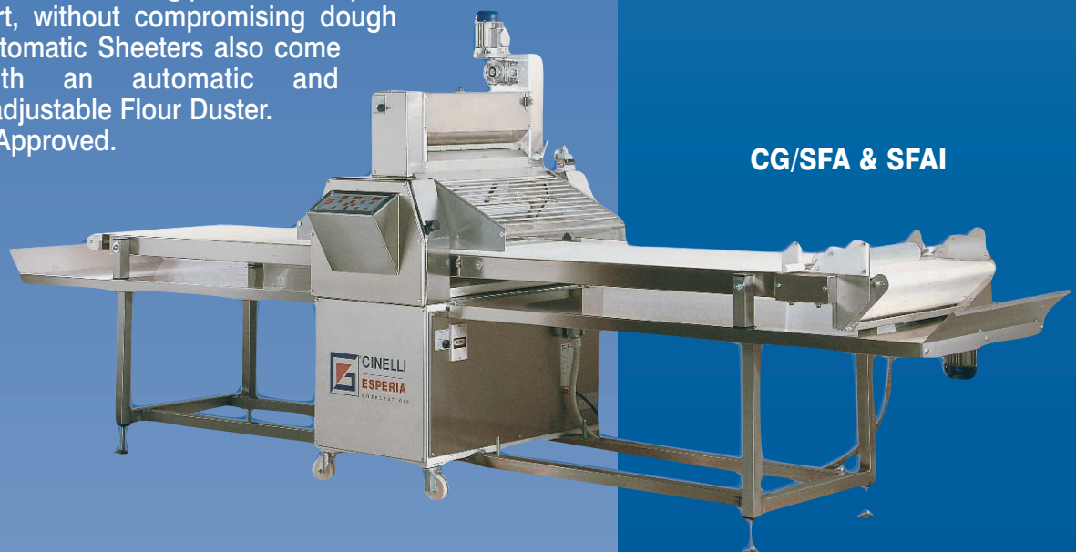
CG/SFA & SFAI

Once desired thickness is achieved at the end of the work cycle, the Automatic Dough Take-Up system rolls the dough onto the rolling pin secured upon the special support, without compromising dough quality. All Automatic Sheeters also come complete with an automatic and incrementally adjustable Flour Duster. Belts are FDA Approved.